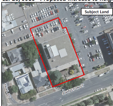
LEP20/0010 - Proposed increase to height of building control

The proposal seeks to increase the Height of Buildings control applying to Lot 1 DP 1028542 from the current 16 metres to 25 metres.