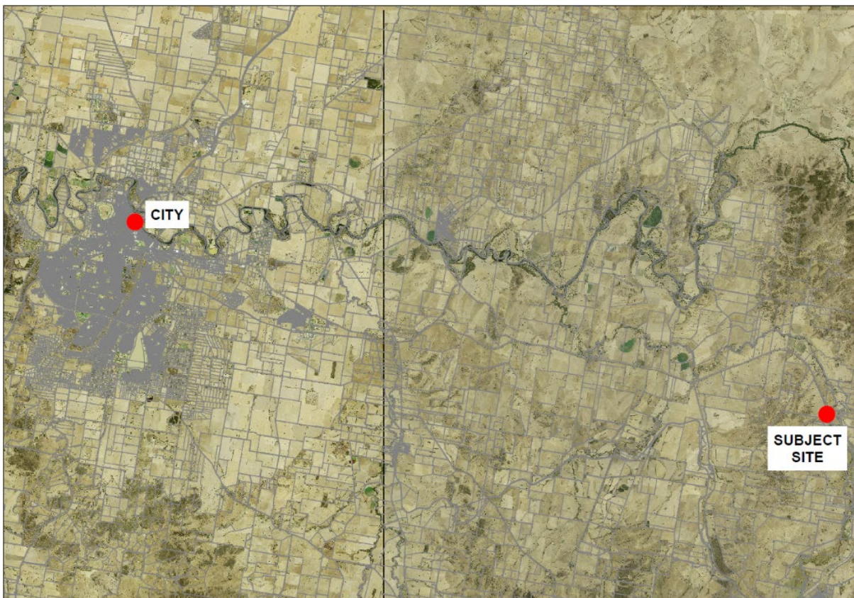
Figure 1 – Site location

The site is located approximately 41 kilometres east of Wagga Wagga on the Sturt Highway. The site's location is shown in Figure 1.