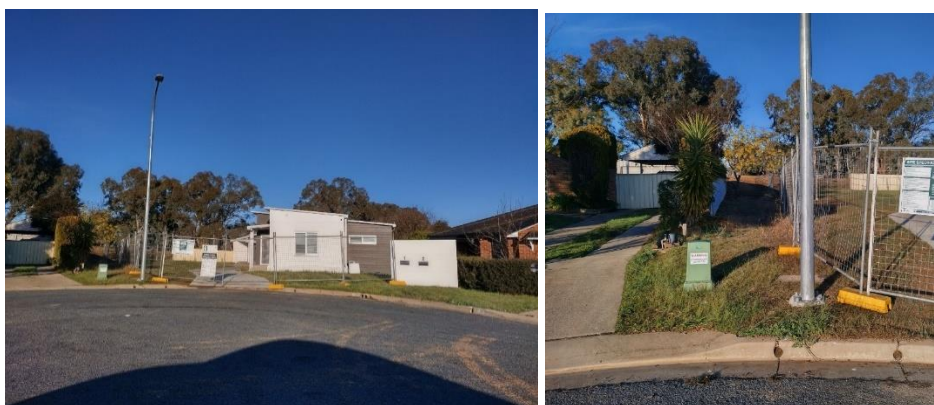
Figure 5 and 6 respectively: Site Photos Bowen Place

As can be seen in Figures 5-7, the laneways in both Boyd Place and Bowen Place are currently not accessible as they lack footpaths, wayfinding signage, and clear legibility.