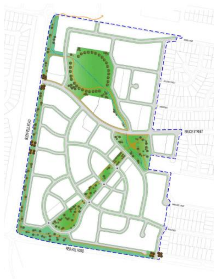
Figure 8 Landscape Masterplan extracted from Draft Concept Masterplan – Tolland Renewal Project

The Tolland Renewal Masterplan was scheduled for public exhibition from 11 September to 24 October 2023. As can be seen in Figure 8, Boyd Place is shown as connecting through to the eastern Jordan Place. This is not inconsistent with the Planning Proposal. Bowen Place is still reflected as a cul-de-sac, which aligns with the Planning Proposal. The proposed land use in the Masterplan appears to be residential and as such the proposed reclassification and rezoning appears to be consistent with the draft masterplan.