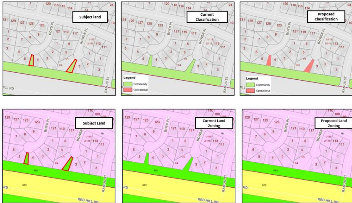
Figure 3 and 4: Proposal outcomes for reclassification and rezoning respectively

Consistent with current controls for minimum lot size, no minimum lot size is proposed as part of this proposal.