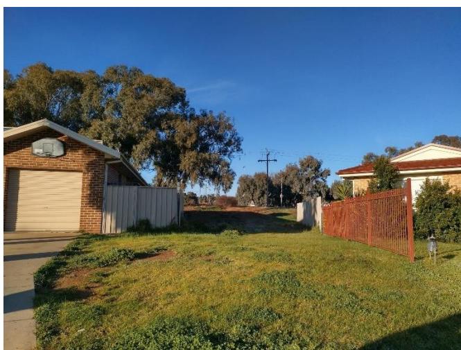
Figure 7: Site Photo Boyd Place