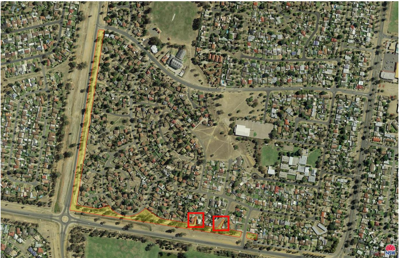
Figure 1: Aerial view of the subject land.