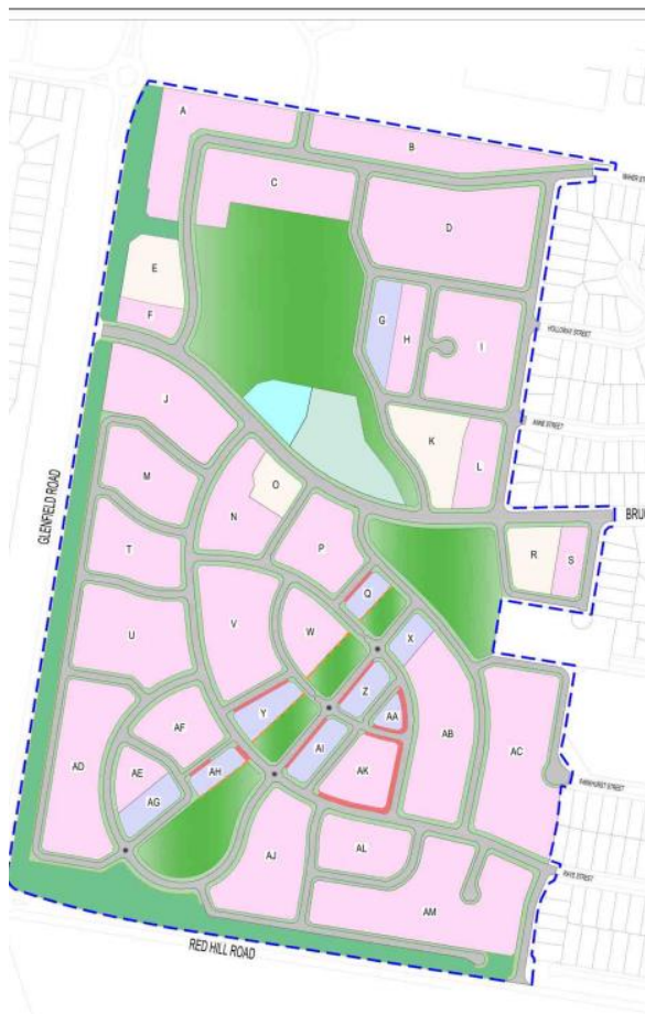
Figure 9 Neighbourhood Masterplan extracted from Draft Concept Masterplan – Tolland Renewal Project