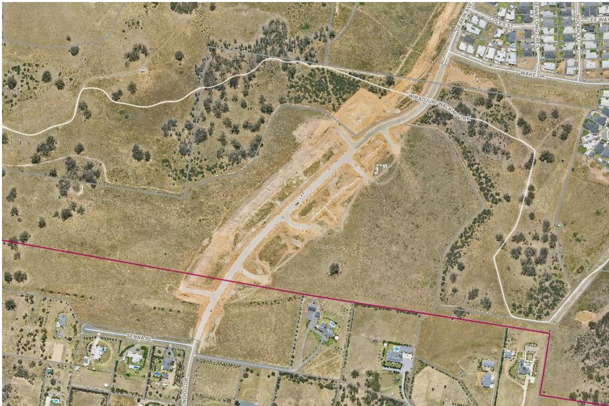
Lloyd Stage 10 Subdivision (November 2023)

The first stage of the development is the extension of Deakin Avenue in Lloyd to connect with Indigo Drive in Springvale to create 41 Lots. Construction of this stage commenced in April 2022 and is nearing completion as shown in the following aerial image and photograph