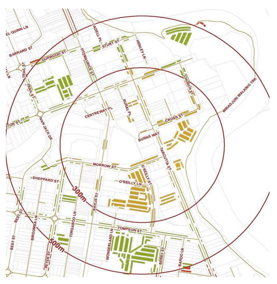
Map of parking in Wagga Wagga Civic Theatre Precinct

A traffic survey of the surrounding roads was conducted on 22 March 2022. It found that, even at peak operation of 1440 patrons, the assessed intersections performed at an acceptable level or service and that the proposed development is fully supportable on traffic flow efficiency grounds. As part of any future development further consultation would occur with Transport for NSW, and as part of any future development application process.