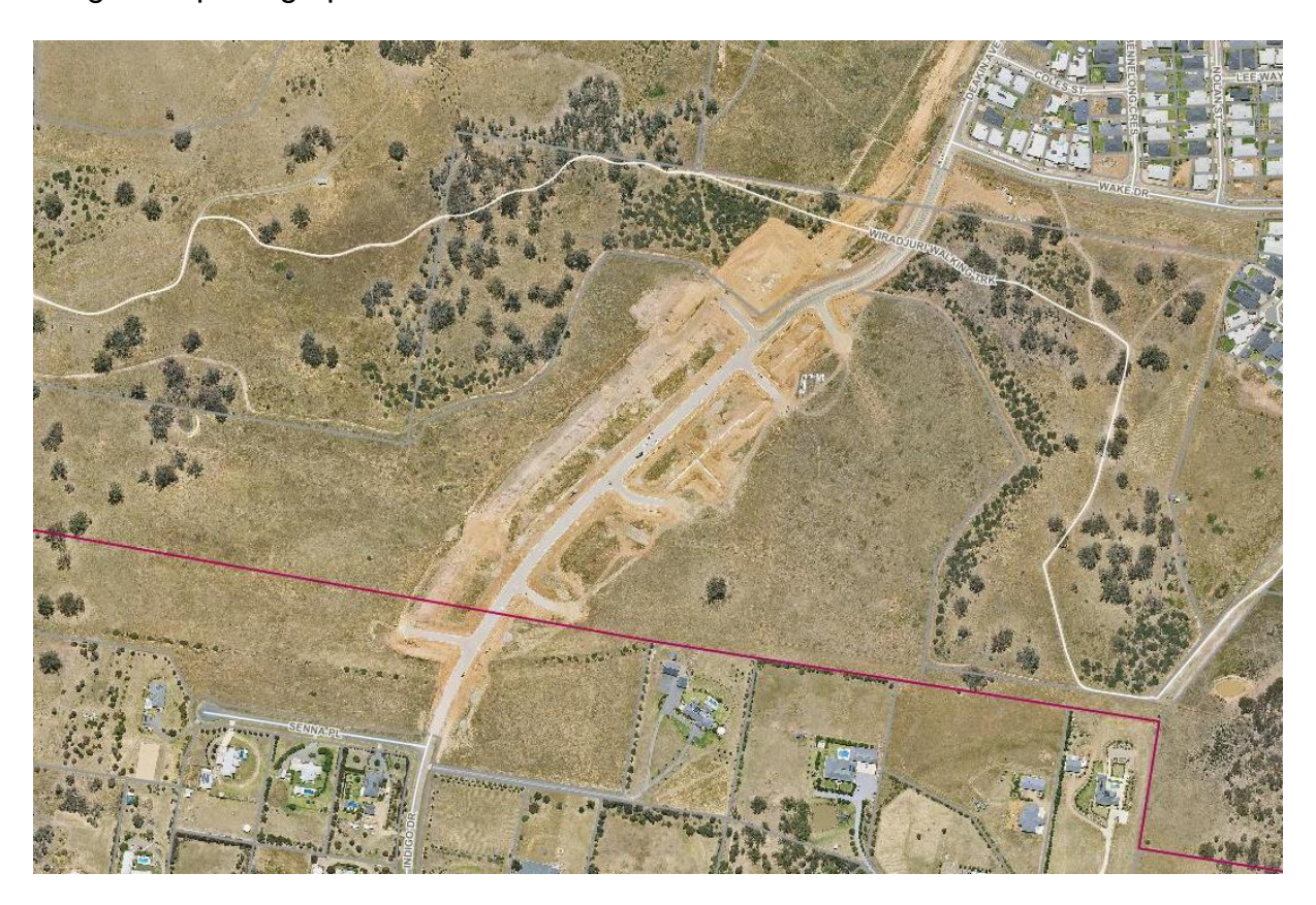
Lloyd Stage 10 Subdivision (November 2023)

The first stage of the development is the extension of Deakin Avenue in Lloyd to connect with Indigo Drive in Springvale to create 41 Lots. Construction of this stage commenced in April 2022 and is nearing completion as shown in the following aerial image and photograph