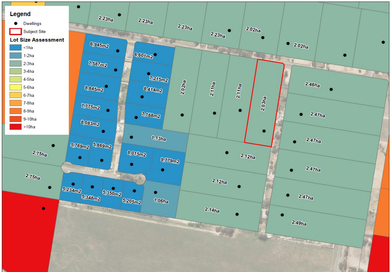
Figure 3: Lot size assessment