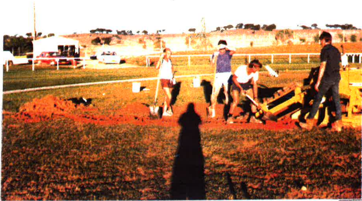
Development Committee - June 1988.