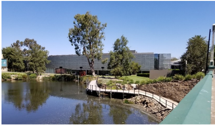
No obvious signage when approaching from the North by car or foot