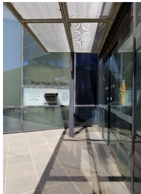
Library signage requires updating and permanency