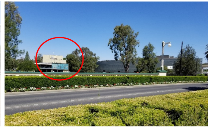
Civic Theatre clearly signed