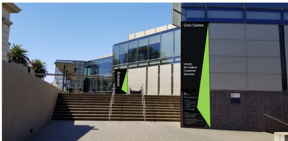
Larger signage required to main entrance