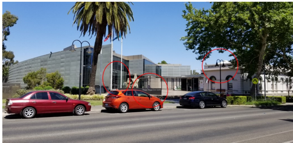
Surrounding building signage is clear. Library signage is minimal.