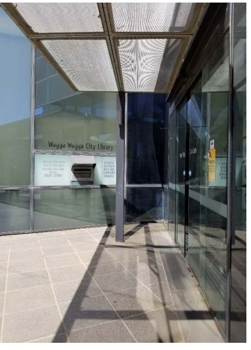
Library signage requires updating and permanency