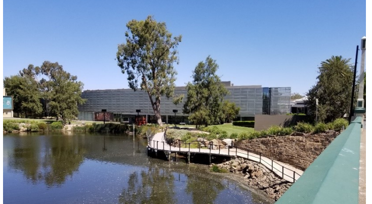
No obvious signage when approaching from the North by car or foot