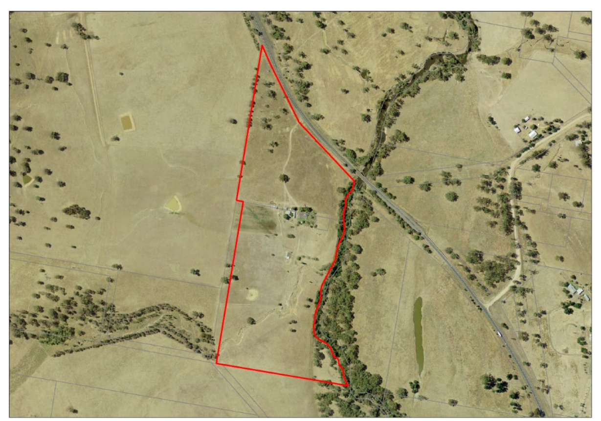
Figure 2 - Aerial image of site